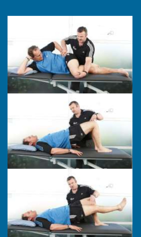
Foot Science I Case Study - Calf Pain